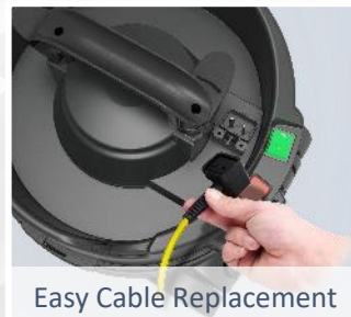
Easy Cable Replacement