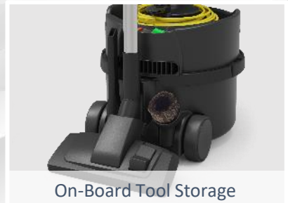
On-Board Tool Storage